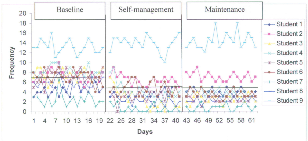
Figure 1: Frequency of calling out behavior.

Figure 1 shows that the effects of self-management strategies for those students with disabilities to reduce their inappropriate behavior. During phase A, the average number of calling out was 7 per student. During phase B, the average number of calling out was 4.7, a decrease of 2.3 calling out per student. During phase C, the average number of calling out was 4.5, a decrease of 0.2 from phase B. The result presents a 33% of decrease from phase A to phase B and a 36% of decrease from baseline (phase A) to maintenance (phase C). This shows that using self-management strategies, students reduced the inappropriate behavior of calling out. Even in phase C, students continued to maintain their progress and their behavior has remained at the similar level as that in phase B, when the self management strategy was implemented. Meanwhile, students presented the appropriate behavior, raising hands to replace their calling out in class. Figure 2 presents the students' behaviors of raising hand.